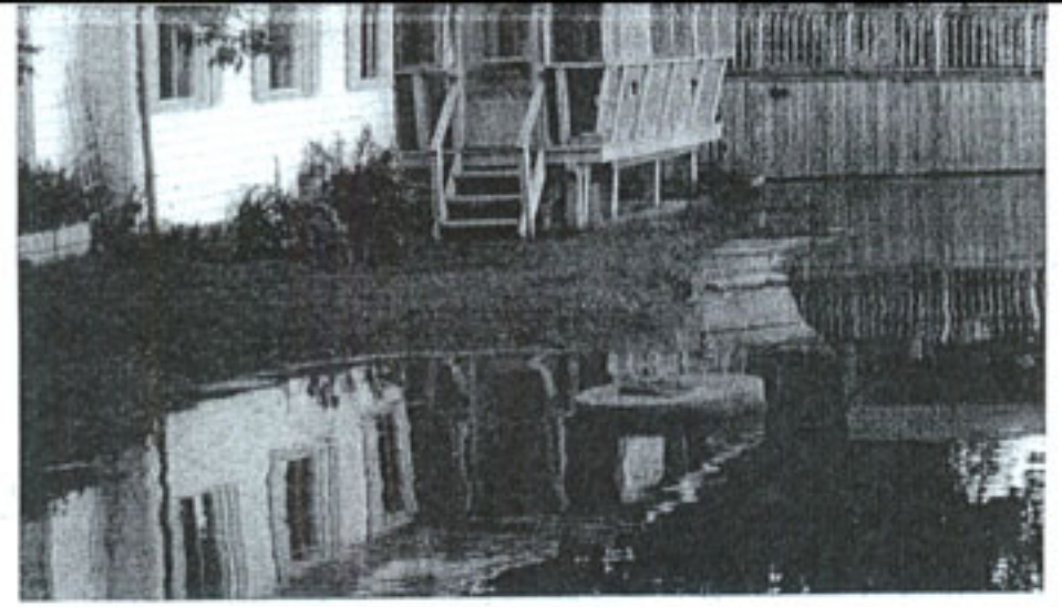
Photo D Flooded conditions June 2008 from boat, looking north. Note well cap.